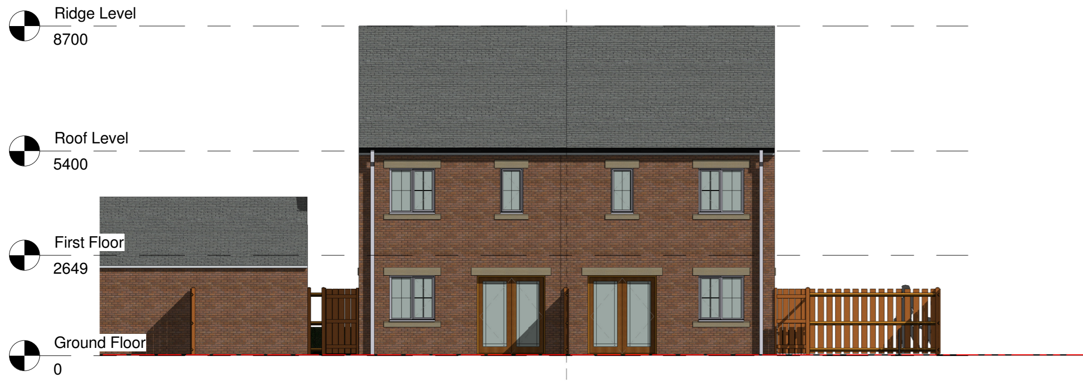
1 3 BED - 850 SQFT - REAR ELEVATION 1 : 100