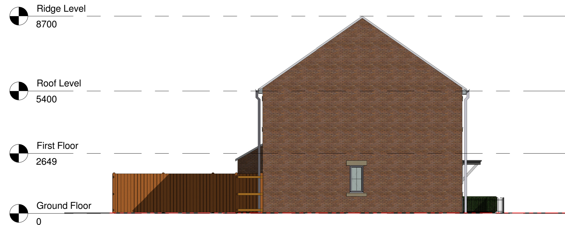
3 3 BED -850 SQFT - SIDE ELEVATION 1 : 100