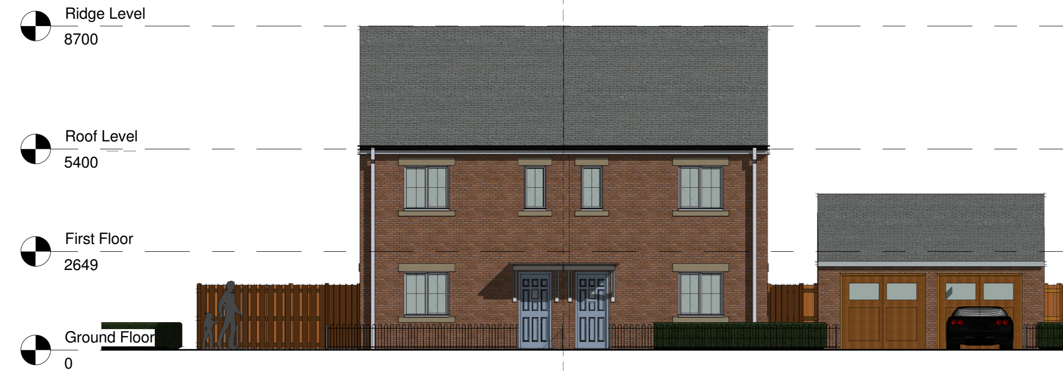
2 3BED 850 SQFT - FRONT ELEVATION 1 : 100